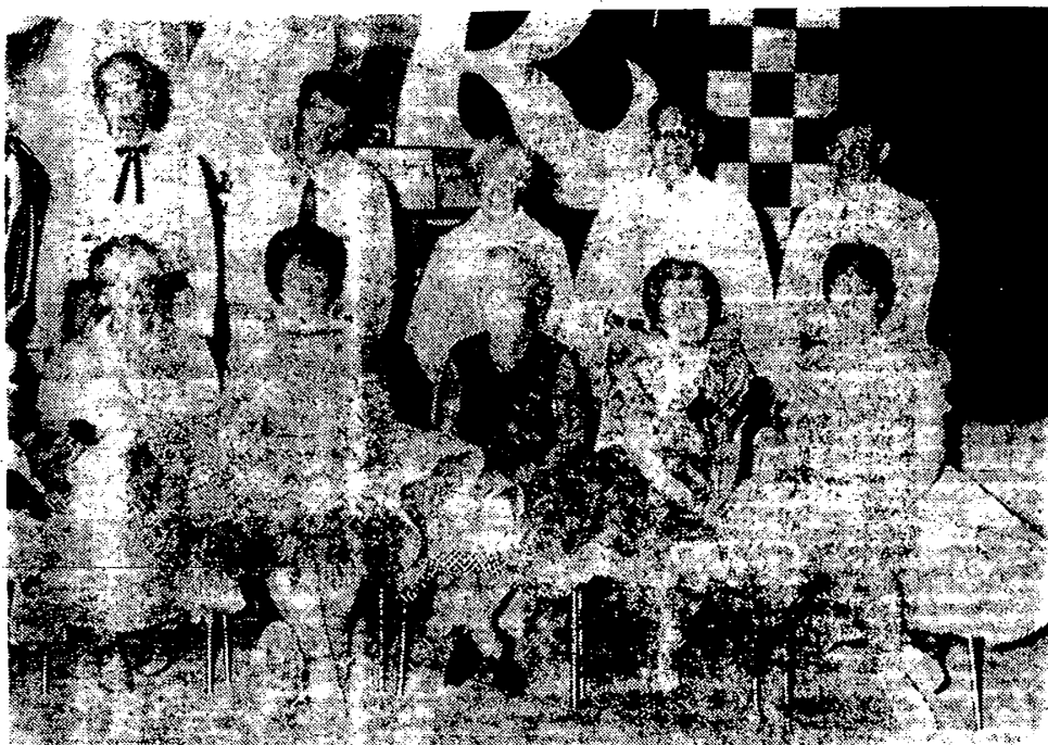
"PAST PRESIDENTS" HONORED BY "GRAND SQUARES" AT THE ANNUAL BALL AT "THE HEATER" IN JUNE. Members that were honored in the above 2 pictures are included in the story at the right of the pictures.