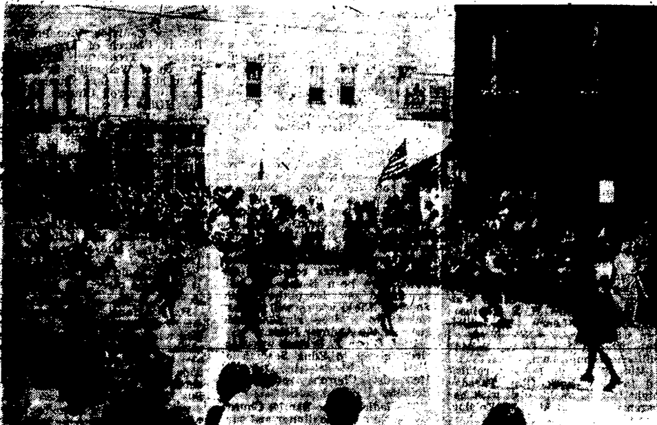
The "Allegheny County Highlanders" from Alfred, the Scottish Bagpipers wearing authentic Highland kilts, that won the first prize of $125 in the "Drum and Bugle Corps" class in the Andover Fourth of July Parade.