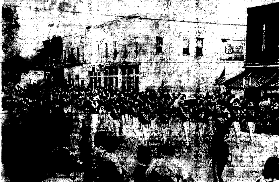
The Bolivar "Bulldog" Band plays a snappy tune as they march down Main Street in the Andover Fourth of July Parade and ended up winning the first prize trophy and $75 cash prize.