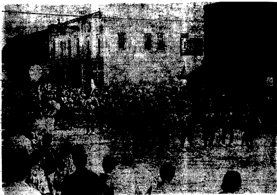
The Greenwood Band with their fine representation won the $50 cash prize for second place in the Andover Annual Fourth of July Parade.