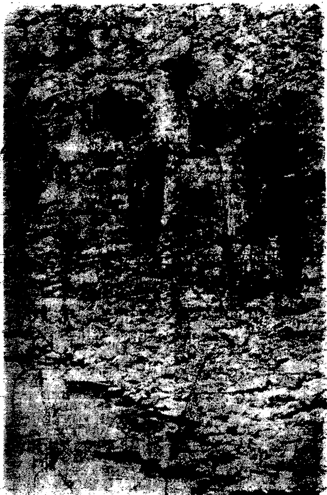
Andover Volunteer Students planting willow trees along Dyke Creek.

2500 basket willows — that's how many were planted by the young gentlemen from Andover Central School, on the banks of Dyke Creek.