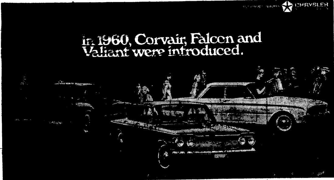
In 1960, Corvair, Falcon and Valiant were introduced.