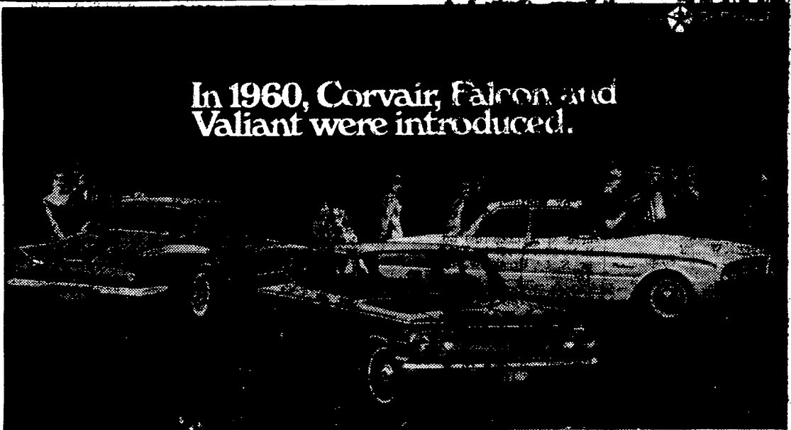
In 1960, Corvair, Falcon and Valiant were introduced.