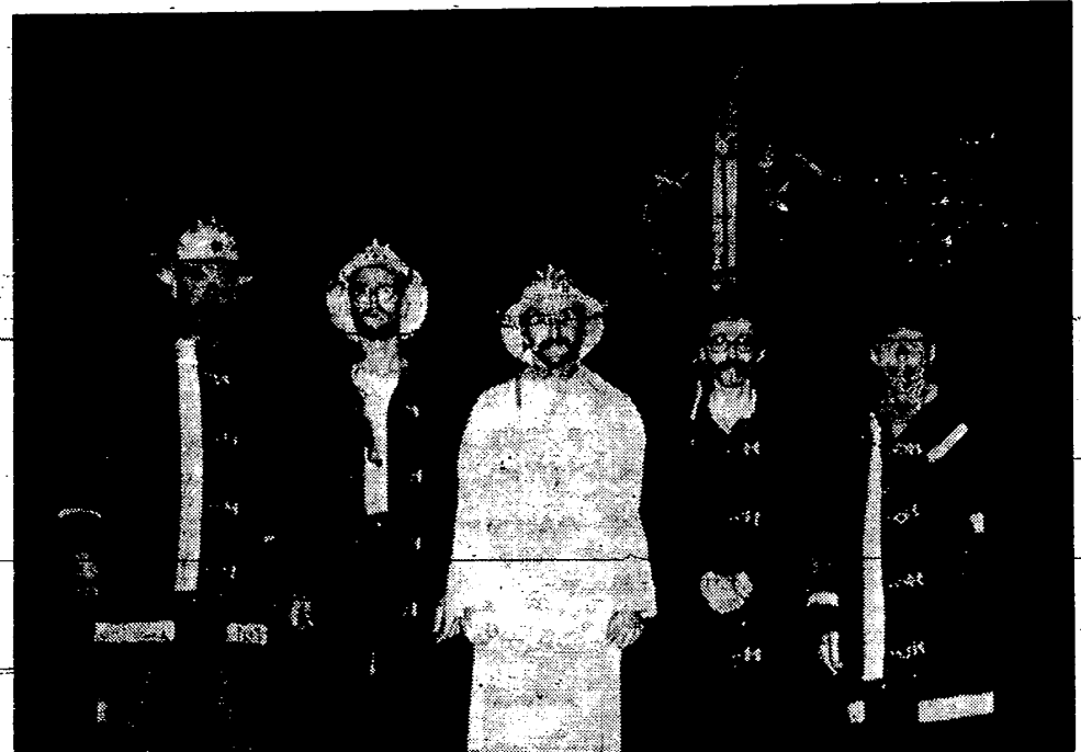
Here are the same boys with their protective clothes all ready to go to work with their cigars already "fired up", to start touching off the fireworks.