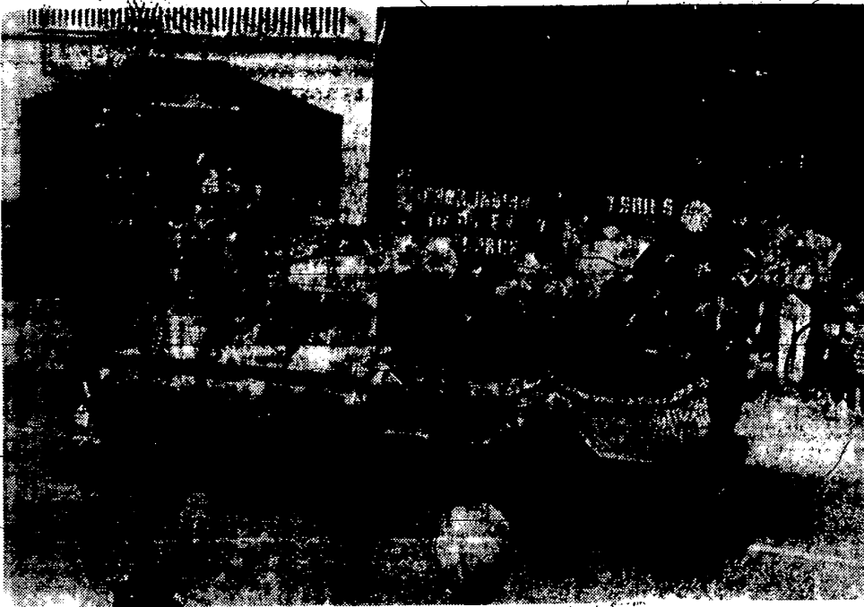
The Parade Committee Float which was not in competition, carries the theme of this year's 4th of July Celebration.