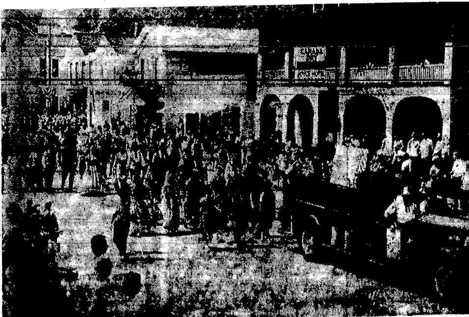
Andover Invaded by Whitesville! The Whitesville Sesqui-Centennial Entry that won a Special Prize in the Fourth of July Parade. Their big Parade is this Saturday night.