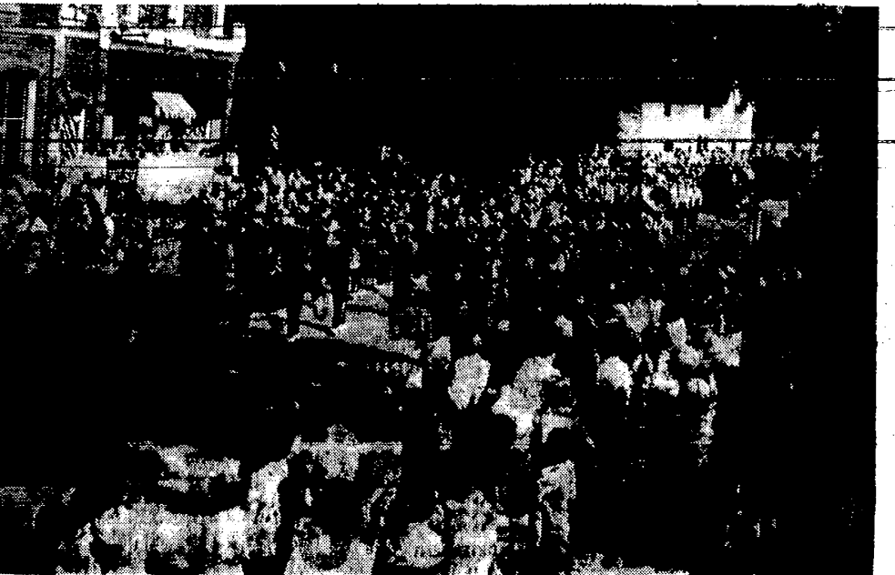
The Andover Central School Band leads the Annual Fourth of July Parade and wins 1st Place in the Band Division.