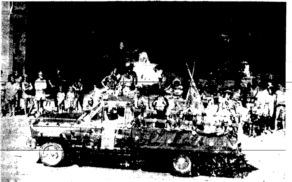
The Andover Firemen's Auxiliary with their float, which won First Prize in the "Most Original" Class.