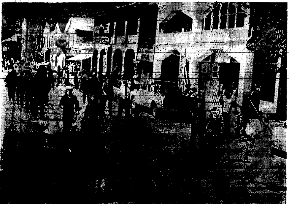
Andover Veterans participate in Memorial Day Parade which saw the largest turn-out and best attended services in many years.