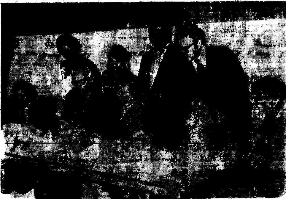
Volunteer workers complete plans to launch the "Symbolic House of Hope" Fund Raising Campaign for the next three year period to make it possible to continue the "Allegany County Senior Citizens Informational Center, Inc. The "Kick-Off" date for the County Fund Drive is scheduled to start Monday, May 17, 1971.