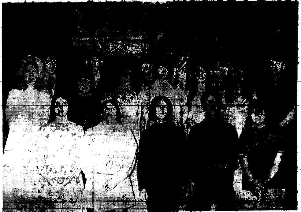
Members of the Junior Play cast that were present at Dress Rehearsal Sunday afternoon. The cast will present "Paddle Your Own Canoe" this Friday evening at the ACS Auditorium.