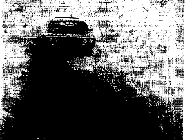
Saturday afternoon the snow banks were still 10 to 12 feet high with only 1-way traffic in front of the Charles Dougherty farm on Joyce Hill - Independence Road. Our car was headed South and a telephone pole can be seen in the background peeping up from behind the huge drift on the East side of the road. News Photo

Last night don't show much progress towards Spring — but at least it has thawed, some in 15 days out of the last three weeks. Here are the recorded Lows and Highs for the last three weeks thru the courtesy of the "Boys down at the Pump Station": Feb. 18 — L 29 H 47; 19 — L 25 H 37; 20 — L 32 H 44; 21 — L 26 H 32; 22 — L 24 H 36; 23 — L 26 H 36; 24 — L 25 H 30; 25 — L 26 H 40; 26 — L 16 H 50; 27 — L 38 H 48; 28 — L 30 H 40; March 1st — a beautiful sunny day with a L 17, H 48; 2 — L 16, H 34; 3 — L 16, H 30; 4 — L 13, H 19; 5 — L 16, H 35; 6 — L 18, H 34; 7 — L 20, H 40; 8 — L 12, H 18; 9 — L 6, H 25; and today the 10th — L 3, H 34.