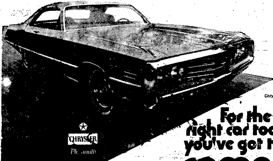
Chrysler Newport 2-Door Hardtop

For the right car today... you've got to... come to the right place.