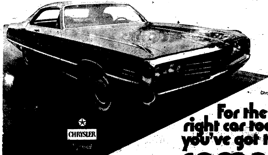
Chrysler Newport 2-Door Hardtop

For the right car today... you've got to... come to the right place.