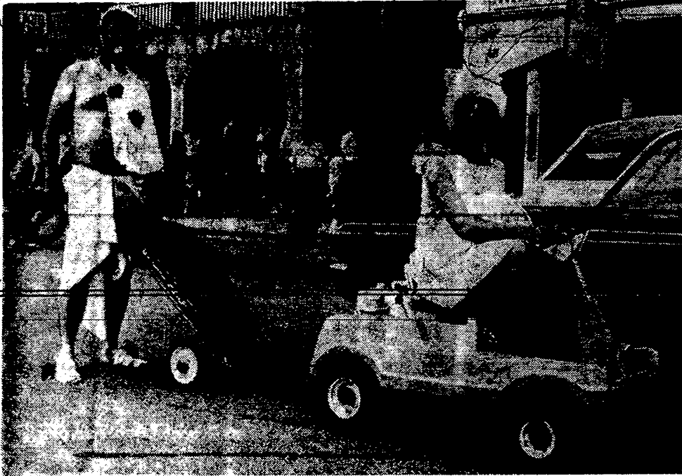
WHOOPS — looks like Mamma Encil should sign Baby Spud up in the Slim Pickins TOPS Club or else change his formula. One of the most unique novelty features of the 4th of July Parade.