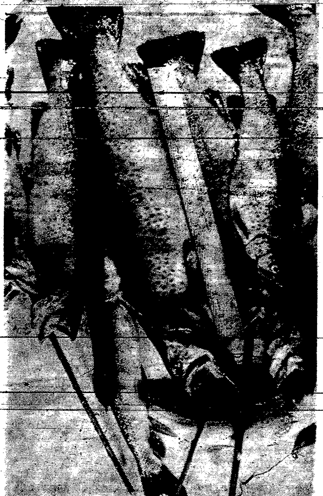
Here is a graphic portrayal of the true size of some of the large "breeder trout" that were killed in Dyke Creek from the "overhead" down stream to Elm Valley as an after math of the gasoline tanker wreck that dumped around 5,000 gallons of gas into one of Andover's trout streams.

Hope your trip through 1969 will be a happy and healthy one.