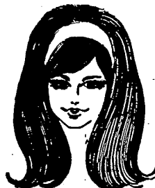
COMES WITH DETACHABLE VELVET HEAD BANDS

It is impossible to distinguish a Hairlon Fall from a fine 100% Human Hair piece. Feels like human hair in every way... shading, styling, and texture, also washable and color fast. Comes in all shades at an unbelievable low price. You can curl easily with rollers, and brush in to Flip or Page Boy. No setting necessary.