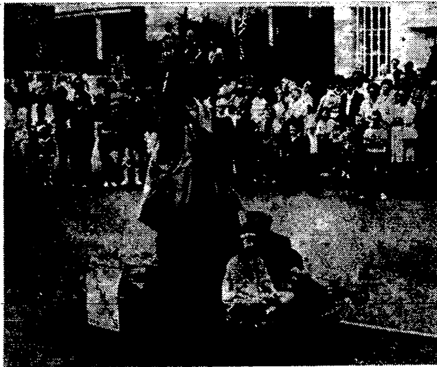
The Andover Fire Department Auxiliary Float — "The Statue of Liberty" that won second prize in the Parade. News Photo