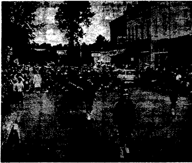
The Andover Central School Band exhibit their talent in winning 1st Prize for Musical Organizations in the 4th of July Parade.