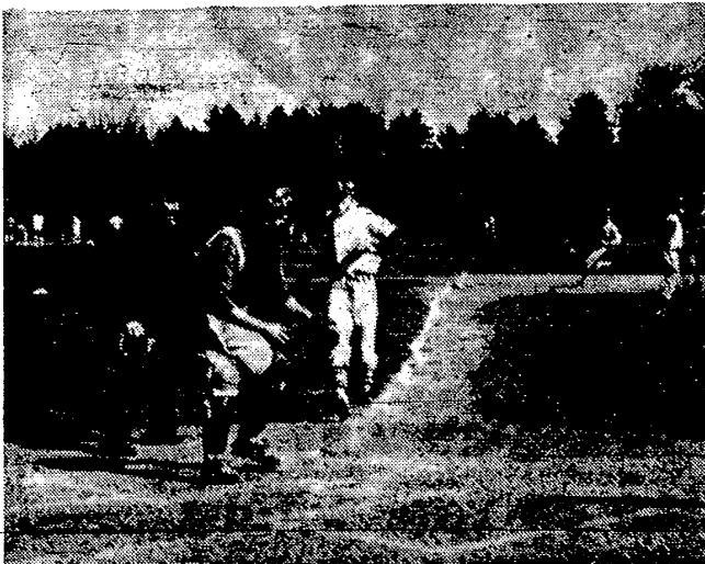
"Greg" Shellman nears home plate to score the 3rd Andover run of the game as the Fillmore Catcher and "Ump" anxiously await the throw in to the plate. News Photo