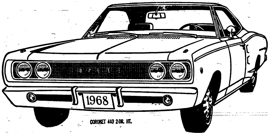
CORONET 440 2-DR. HT.