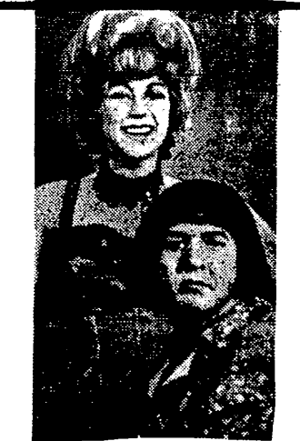
Opening Sunday at the Babcock Theatre Sonny and Cher, popular song team, make their screen debuts playing multiple roles in "Good Times", Columbia Pictures release in color by De Luxe. Here, they appear as Sheriff Irving Ringo of Broken Elbow, Neb., and Nell Belle, the true-blue dance hall queen. They also star as themselves.

Commercial Printing at The News Printing House.