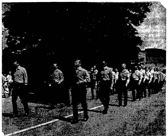
The Whitesville Firemen's Unit that won First Prize in their class on the Fourth of July, steps off a lively cadence as they go down Main Street.