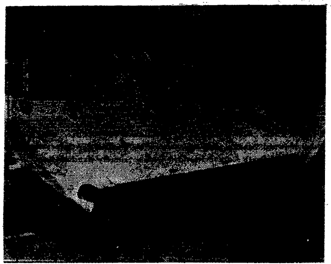
The "Weasel", an amphibious, Full-Track Vehicle, that was part of the Civil-Defense entries in the 4th of July Parade.