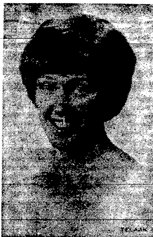
Judith Lynn Woodruff