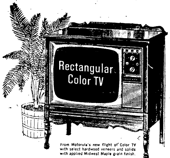
From Motorola's new flight of Color TV with select hardwood veneers and solids with applied Midwest Maple grain finish.

Announcing a new screen size in Rectangular Color TV