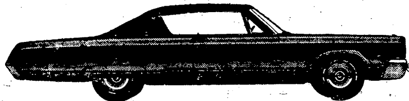
Newport Custom 2-Door Hardtop