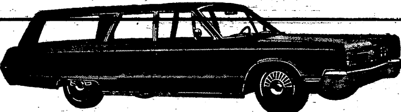
Luxurious New 4-Door Wagon

STOP IN TAKE CHARGE MOVE UP TO CHRYSLER '67