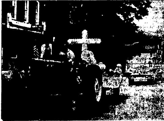
Taken from the Front Page of the July 9, 1964 Edition of the Andover News.

The First Presbyterian Church Float "God's Helping Hand", winner of the First Prize. Photo by Wittie