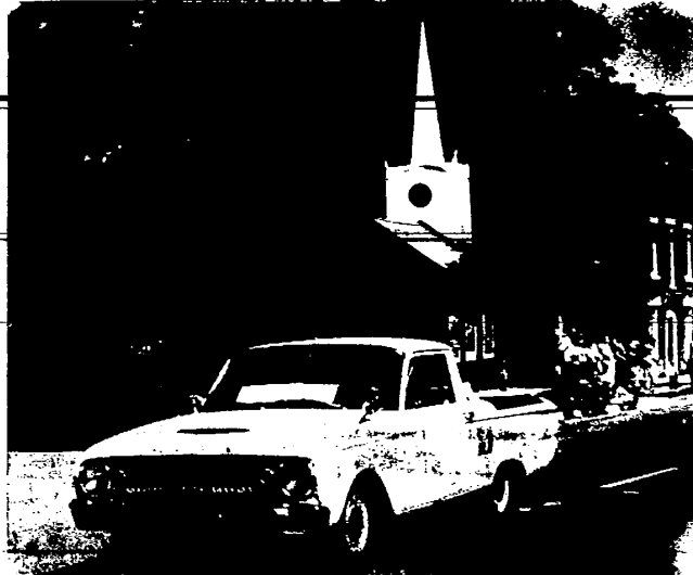
Taken from the July 11, 1963 Issue of the Andover News The Methodist Church Float in the 4th of July Parade

The First Presbyterian Church Float "God's Helping Hand", winner of the First Prize.