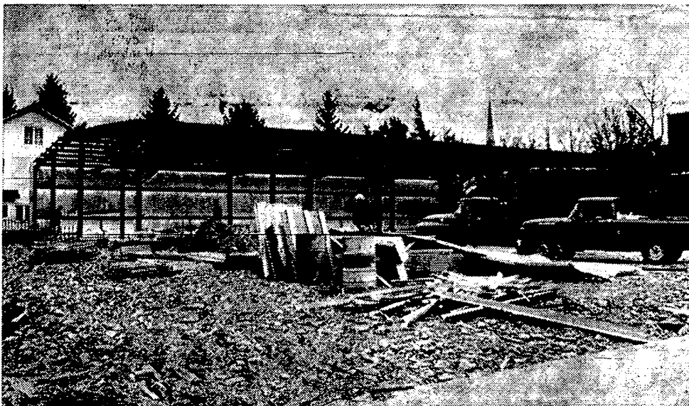
The New Market Basket Super-Market being built by Ford & Peckham builders takes form. With the steel all up, the back sidewall and the roof on, all of the under-ground plumbing and electric wiring completed, the concrete floor two thirds poured, it appears as if the June 1st dead-line will be met and the store should be open to the public on or before July 1st.

VOL. 102, NO. 16 Andover, N. Y. Thursday, April 21, 1966 Published Weekly by The News Printing House, Andover, N. Y. $3.50 year, 10c copy