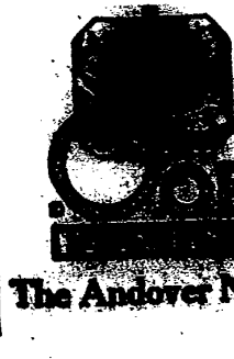
The Andover News