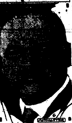
Sen. Charles Curtis of Kansas is the new Republican leader in the Senate, elected after senior Senator Warren of Wyoming declined. Senator Curtis is more than half American Indian.