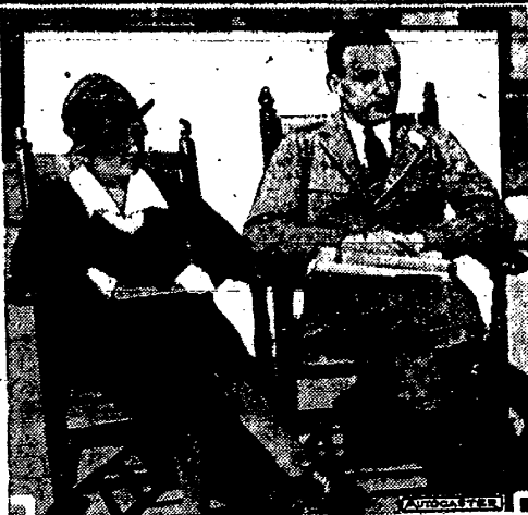
Edsel Ford, son of Henry Ford, who is every day taking on additional responsibilities in the active management of the Ford industries, has inherited the keen business mind of his famous dad, say industrial giants, who recently had the opportunity to study him in action. Photo is a recent picture of Edsel Ford and his wife.

This is a good time to sell farm land. And most sales of farms are brought about through classified ads. —The ad which creates or renews or increases the interest of the reader in your store—is a GOOD Ad.