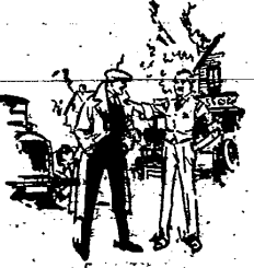
"Find the U. S. Tire dealer with the full completely lined line of U. S. Tires."

The tire buyers of the land have responded with a mighty U. S. Tire following.