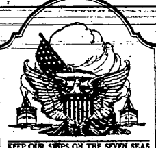
KEEP OUR STRIPS ON THE SEVEN SEAS

Importers, exporters, travelers—ship and sail under—the Stars and Stripes