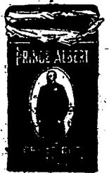
Prince Albert is made in a special way, by our exclusive patented process, and is the only pipe tobacco that is so cool and so free from bite and parch.

Ever roll up a cigarette with Prince Albert? Man, man—but you've got a party coming your way! Talk about a cigarette smoke; we tell you it's a peach!