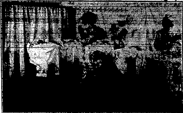
CHILDREN'S WARD ST. MARK'S HOSPITAL OF NEW YORK CITY Second Avenue at Eleventh Street, New York City