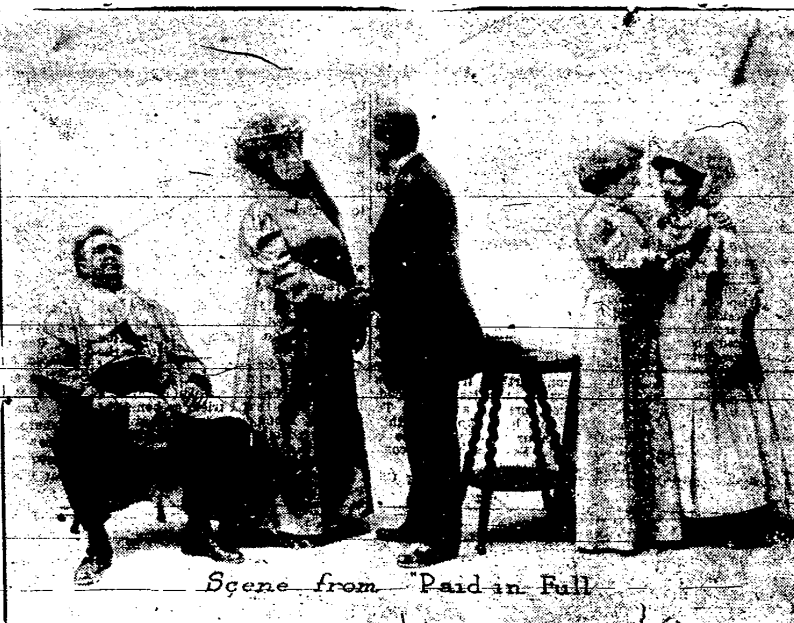
Scene from "Paid in Full"

By all Means the Best Show Ever Seen in Andover